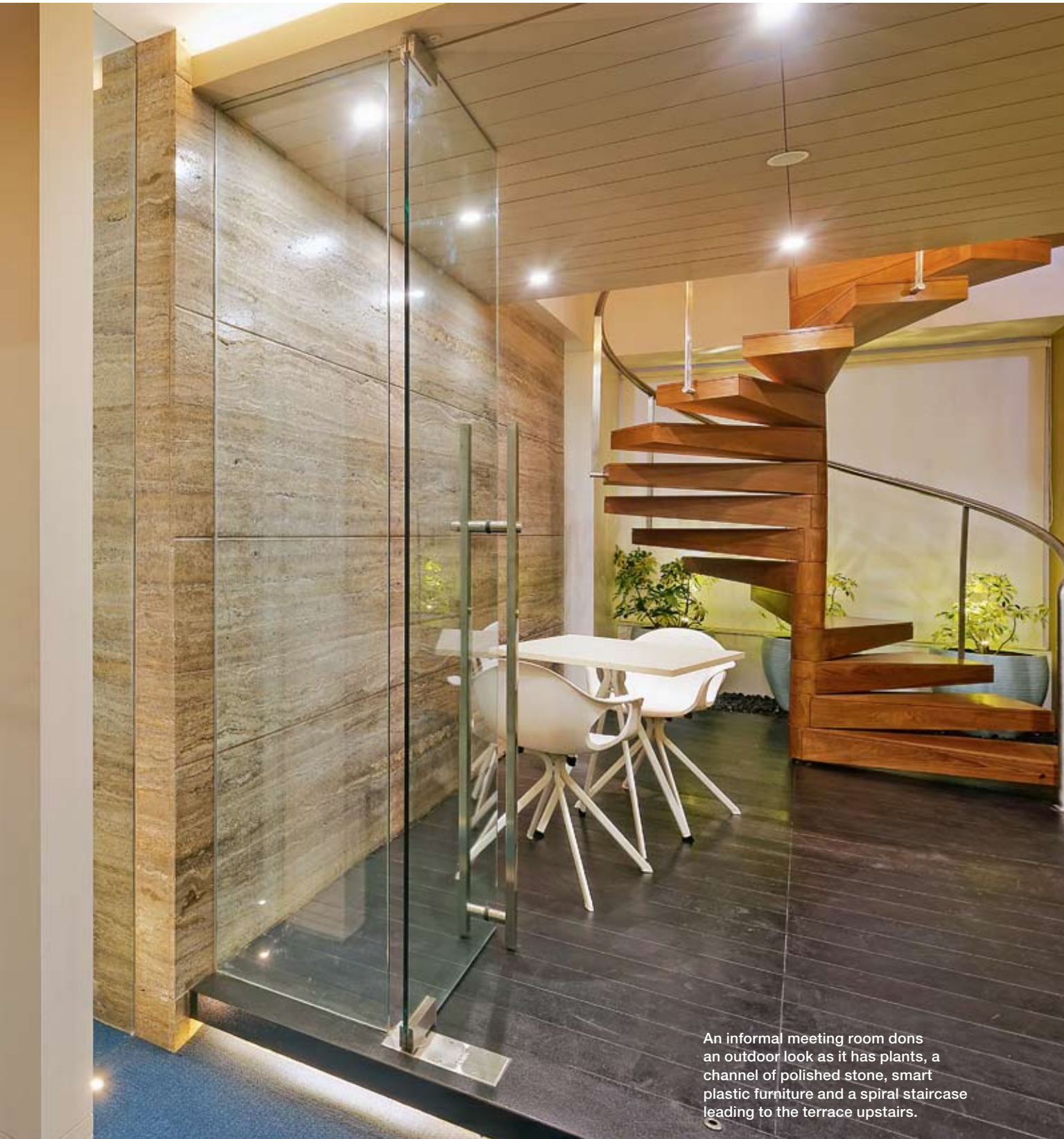
An informal meeting room dons an outdoor look as it has plants, a channel of polished stone, smart plastic furniture and a spiral staircase leading to the terrace upstairs.