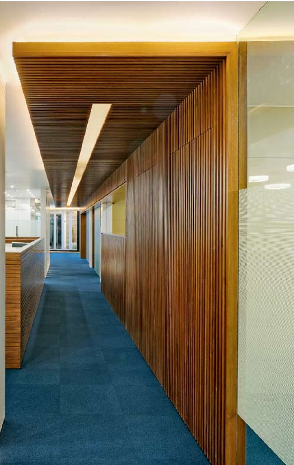
(Left and far right) A stretch of ribbed wooden panelling running from floor to ceiling and across the ceiling, a play of textures, colours and set-backs add interest to the passage that runs the length of the office.