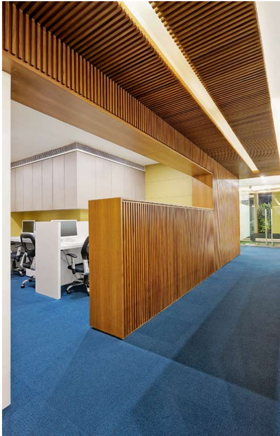
(Centre) Pendant lamps – along with recessed LEDs – ensure even lighting in daylight tones.